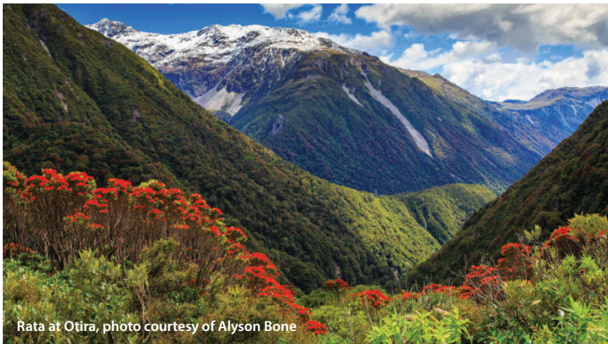
Rata at Otira, photo courtesy of Alyson Bone

This Crimson Trail is a journey from the north to south on the West coast of New Zealand's South Island. As you travel some 500 kilometres you will see significant glaciers, wild coastline and large tracts of primeval forest.