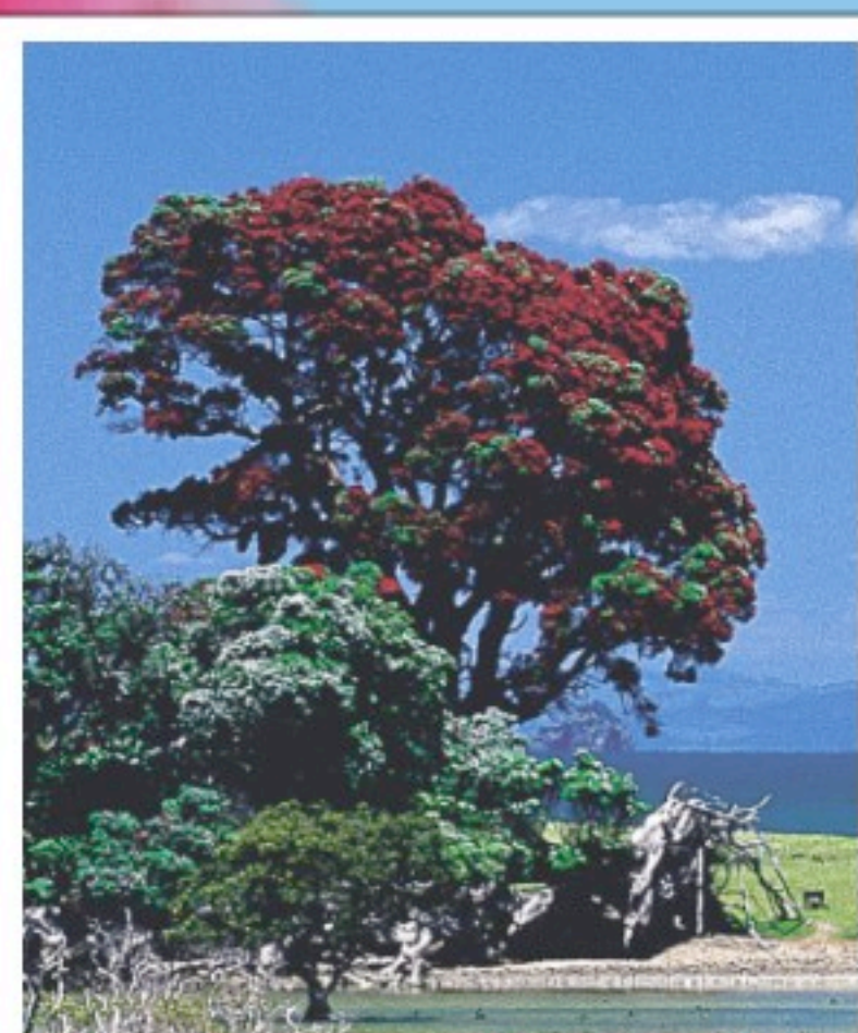
Pohutukawa north of Colville