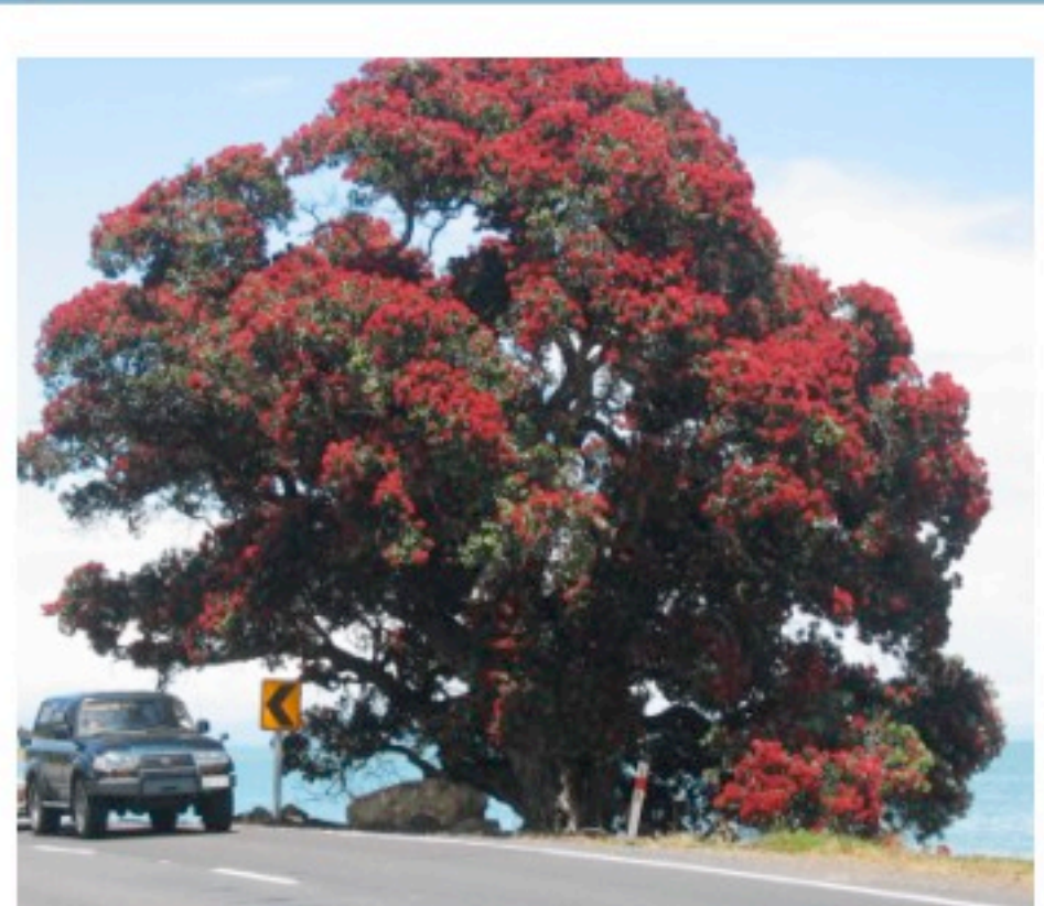
Thames Coast Road